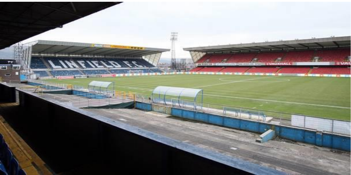
The West End or Kop End and the Main Stand