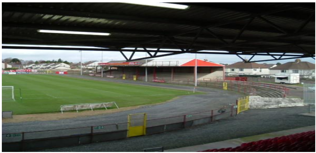
The old ground before development

past Quick Fit and over the railway bridge then at the Car showroom keep on walking the ground is just of the Armagh and Brownstown Road junction on the right. This is an 18 minute walk.